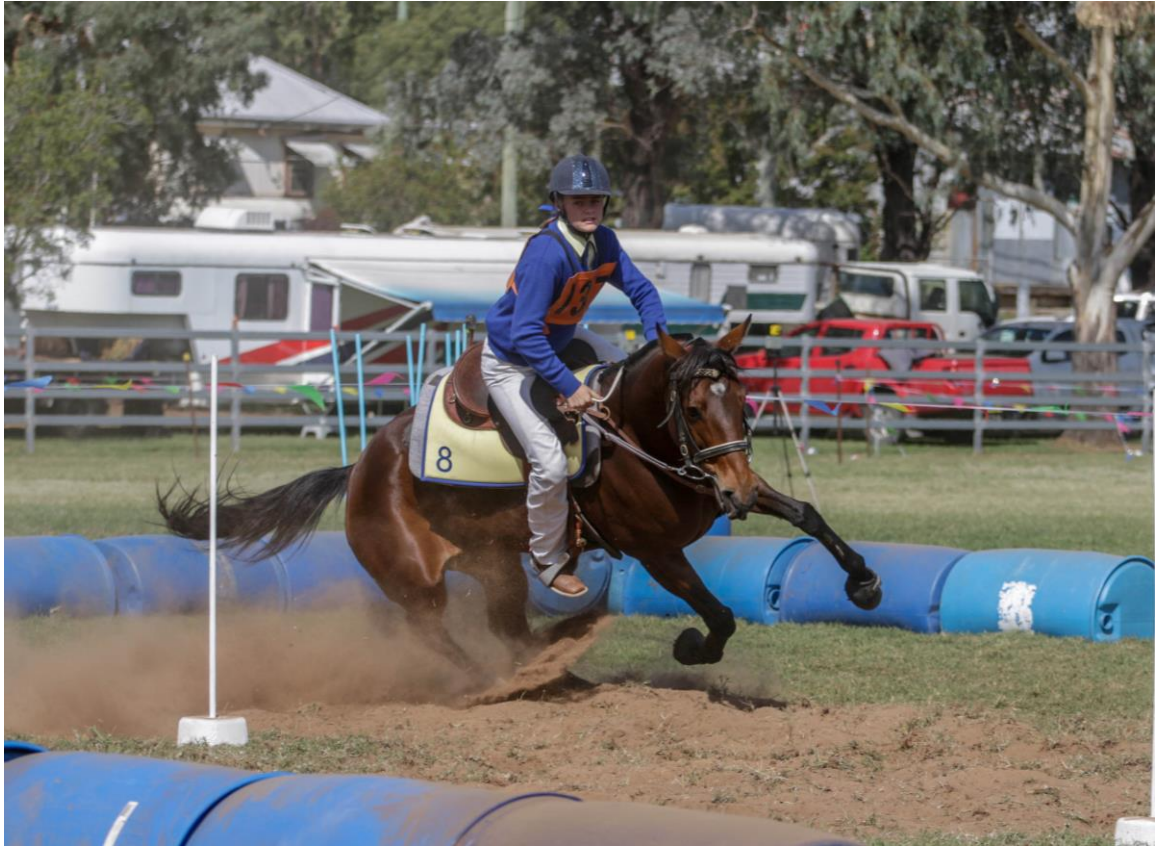
at our 2019 Sporting Championship - Merriwa

TO BE HELD AT 'Dunrobyn', Gravesend NSW Sporting – Saturday 18 th April Campdraft – Sunday 19 th April Team Penning – Monday 20 th April